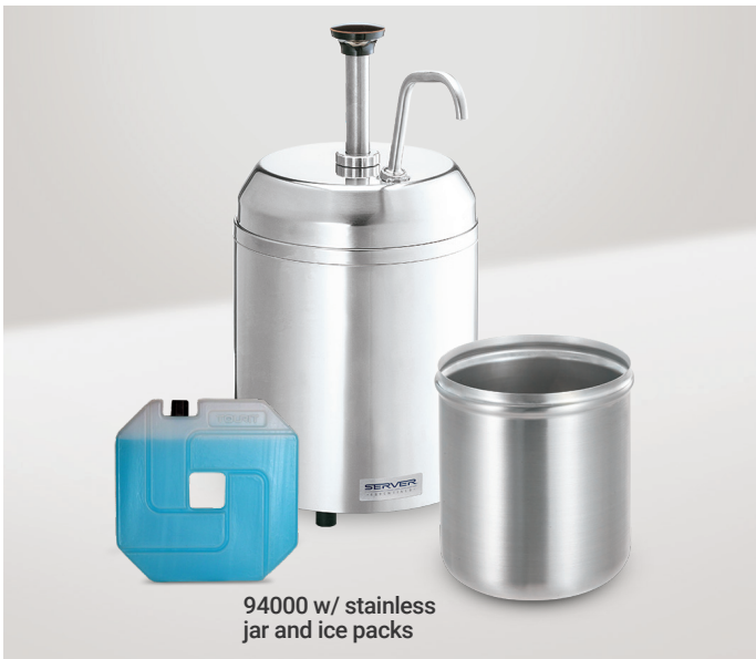
94000 w/ stainless jar and ice packs